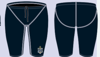
JAMMERS (swim shorts)