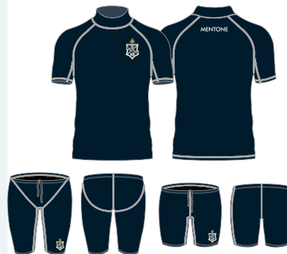
JAMMERS (swim shorts)