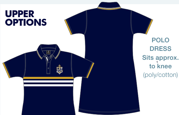
POLO DRESS Sits approx. to knee (poly/cotton)