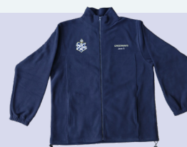
GREENWAYS POLARFLEECE JACKET (Compulsory Year 9)