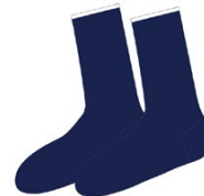
MG SOCKS (white trim)