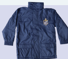
RAIN COAT Years 5 & 6