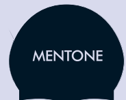
SWIM CAP (compulsory see guidelines)