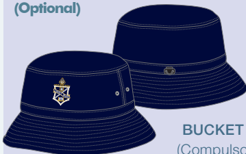
BUCKET HAT (Compulsory for Terms 1 & 4)