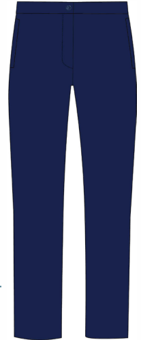
NAVY PANT (Relaxed & Tailored options)