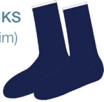
MG SOCKS (White trim)