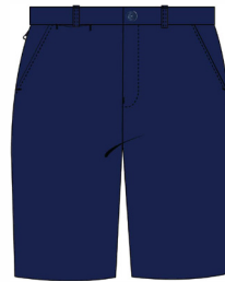
NAVY SHORTS (Relaxed & Tailored options)