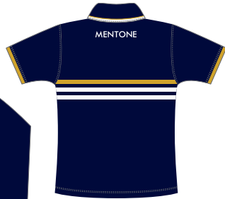
PE POLO TOP (airtech material) Short & Long sleeve options (poly/cotton version for ELC – Year 4)