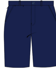
NAVY SHORTS (Relaxed & Tailored options)