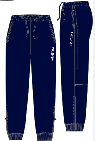
ACTIVE TRACKPANTS (Endurance version with reinforced knee available for F - Year 4)