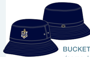
BUCKET HAT (compulsory)