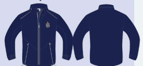
OUTER QUILTED COAT (LONG-LINE)