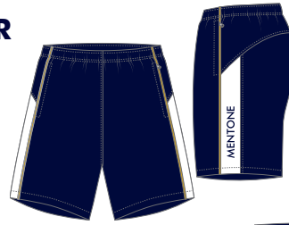
PE SHORTS (Relaxed & Tailored options)