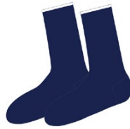
MG SOCKS (white trim)

Choose at least ONE of the following items + MG navy socks (or navy tights)