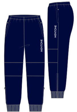
ENDURANCE TRACKPANTS (Reinforced knee)